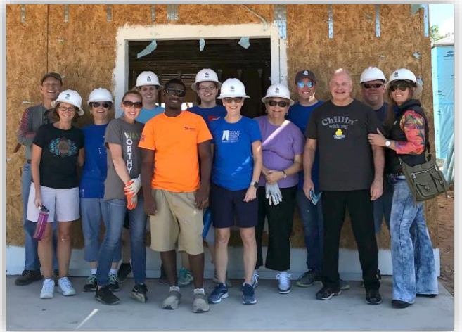
2019 Staff Habitat for Humanity Build Day

Director of Programs Director of Communications Director of Children's Ministry* Events Coordinator (Volunteer) Nursery Assistant*