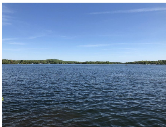
Sunny day at Lake Pocotopaug!

Other area destinations include Salmon River State Forest, Devil's Hopyard State Park, Hurd State Park, Gillette Castle State Park, Gay City State Park, and the Airline Trail State Park. These parks offer fishing, picnicking, bicycling, hiking, running, and dog walking. The Airline Trail passes through the center of town and is within walking distance from our Church. One of the few remaining covered bridges in Connecticut spans the nearby Salmon River.