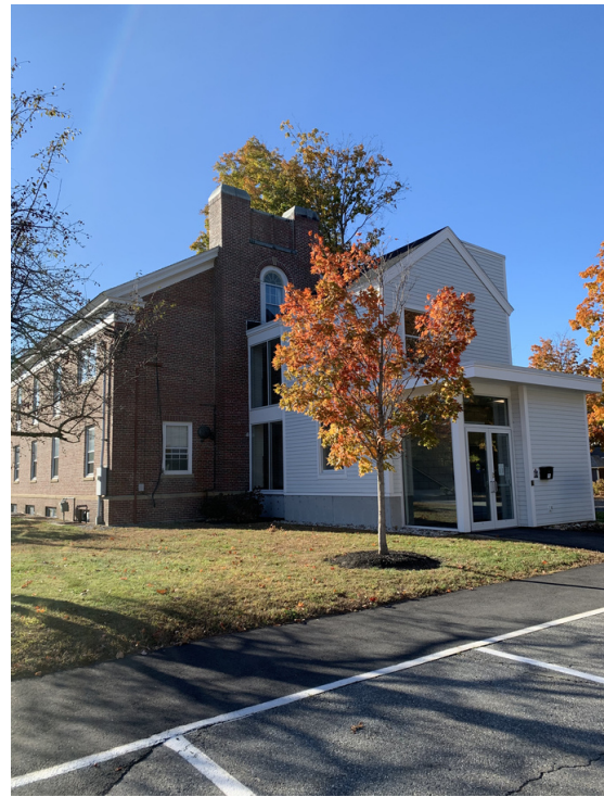
Pilgrim House (Church office, community meeting space, and Church school) Renovated in 2018 with elevator and new entry.

"First Parish Church is an anchor to beautiful downtown Brunswick, especially during these difficult times. The design of the church adds so much much to our historic downtown and the rich history of the church has played an integral role in the development of our community."