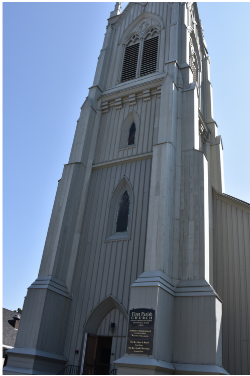
First Parish Church (Front entrance on Maine St.)