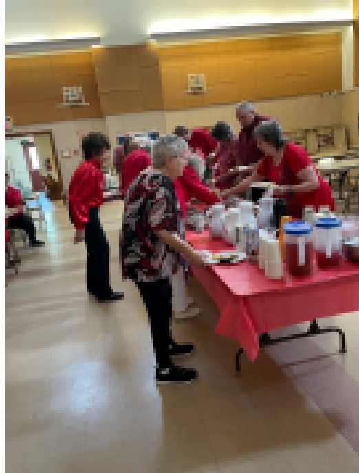
The social hall during coffee hour after the worship service. This room can also be a gymnasium, with features that allow a basketball hoop and volleyball net to be installed.