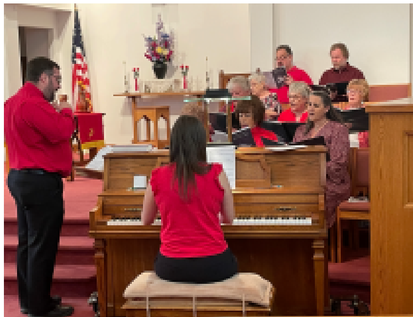
The choir is practicing before the worship service.