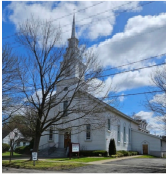
Our church building, rebuilt in 1987 after being destroyed by fire in 1985.