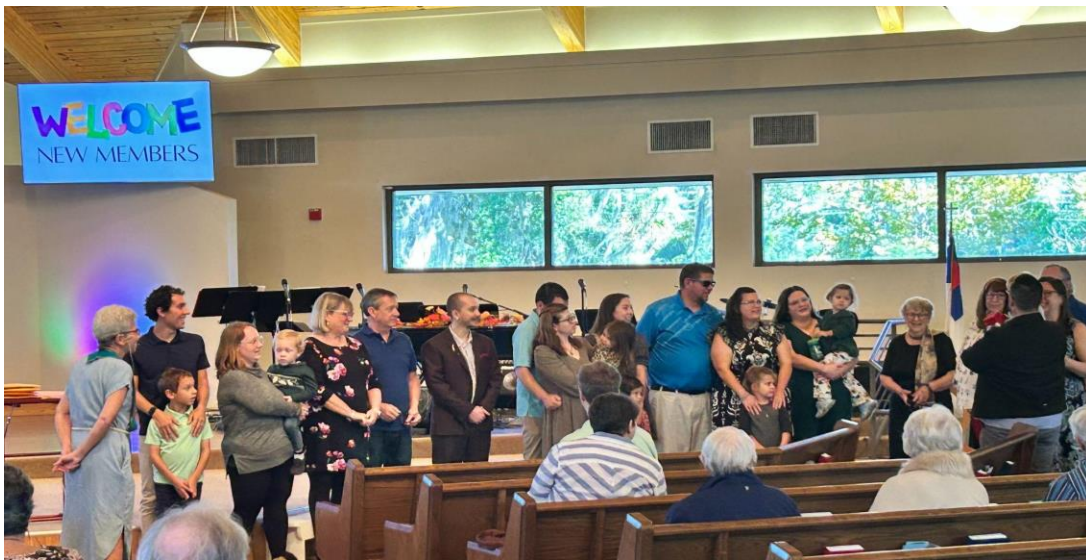
Welcoming 16 new members on 11/16/24

backgrounds (Baptist, Catholic, evangelical, no-faith traditions) and parts of the country and world. While we have not gone through the formal O&A process, we are, in practice, Open and Affirming.