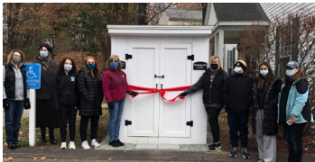
Barnabus Barn for food drop offs

The Faith in Action is the heart and soul of our mission-focused church. These important ministries are explained in detail below.