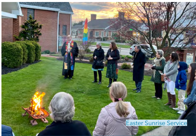
Easter Sunrise Service