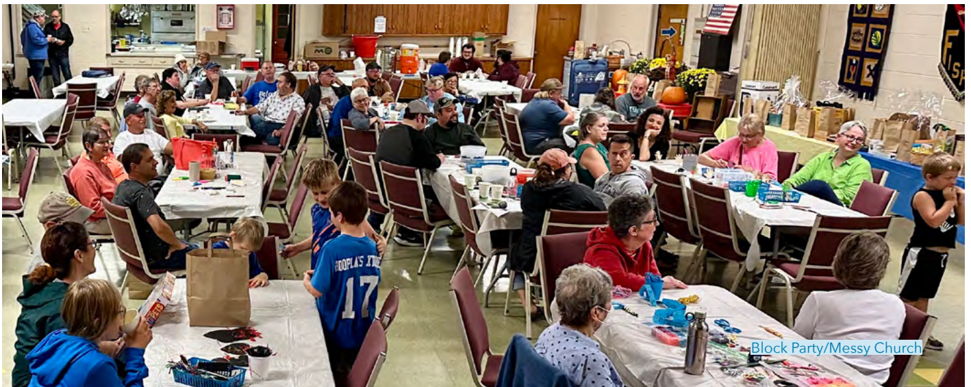
Block Party/Messy Church

can be found on our website and at this link: St. Paul's Strategic Plan . This visioning process clarified the need for additional ministerial support to achieve our goals. Therefore, we are searching for an Associate Pastor to enable us to both better do the things we currently do as well as launch the new programs and objectives in our strategic plan. A description of the attributes we seek in an Associate Pastor and details of the duties the individual will undertake is found on the next pages.