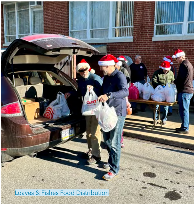
Loaves & Fishes Food Distribution

We grow in our faith in a variety of ways. We offer a rotating topic-based adult education program, led by church members. This past fall, the topic centered on reading and discussing some of our favorite Bible stories from the First Nations Version of the New Testament. Prior adult programs have included more traditional Bible studies, book discussions, and video series on current events or topics such as racism. There is a Children's Message that is part of each Sunday morning service, offered by a rotating group of adult volunteers. After the message, the children go to Sunday School for the rest of the service. There is a