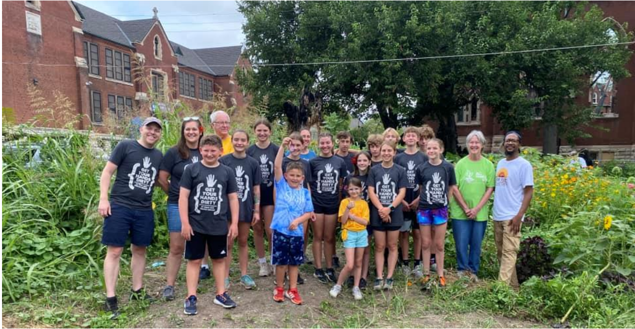
2023 Mission Trip – Amen St. Louis