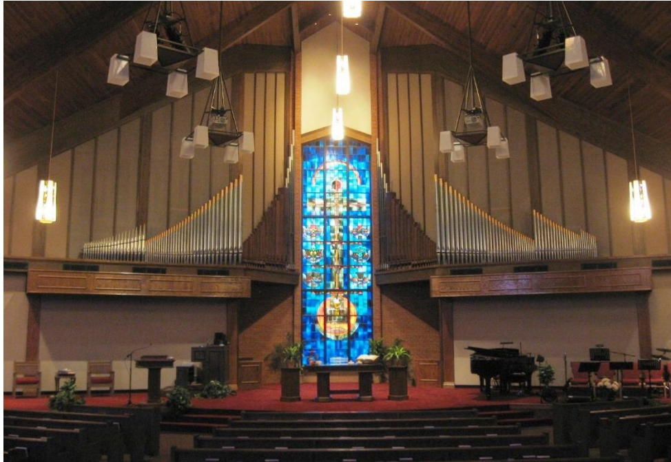
St. Paul's Sanctuary