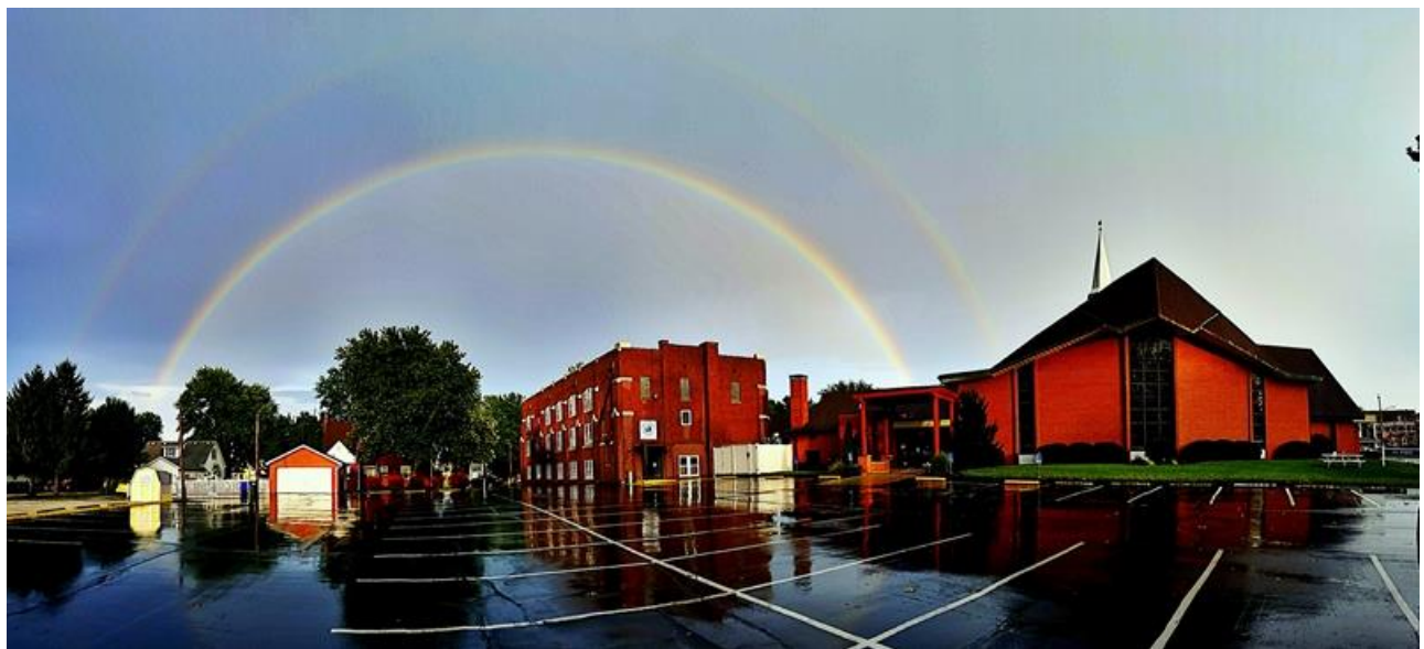
This shows the church, parking lot, Parish Hall building, parsonage and rental house.