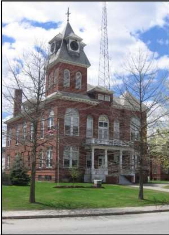
Lamoille County Courthouse built 1911

Hyde Park Village is home to the Lamoille County Courthouse and Sheriff's Department, the Lanpher Memorial Library, the Governor's House (now a bed and breakfast), the Lamoille Restorative Center, and the Hyde Park Opera House (home of the Lamoille County Players). A homeless shelter serving the Lamoille Valley is located in the village. Two Sons Bakery and Restaurant is within walking distance of the church, as are all the places mentioned above. The village of Hyde Park is quiet, with mainly local traffic. Many services, shopping, and restaurants are located in nearby Morristown and the resort town of Stowe.