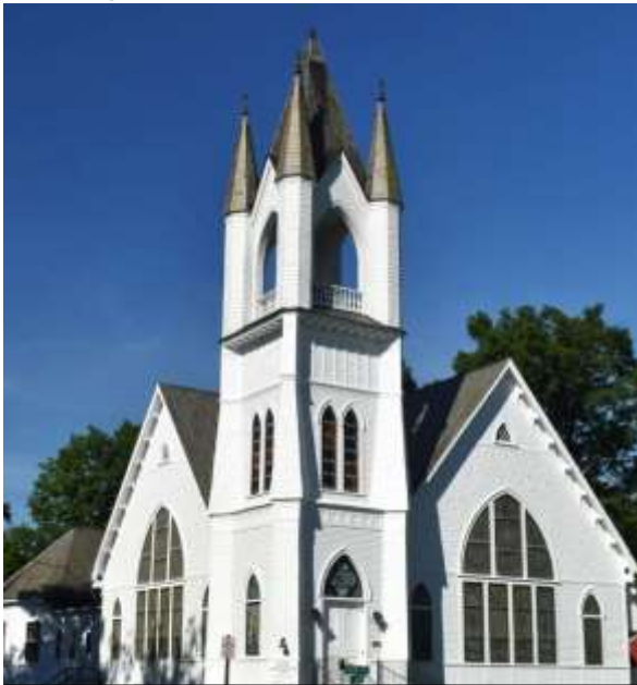
Second Congregational Church of Hyde Park Vermont

We have been blessed with strong lay leadership that takes an active and vital role in our spiritual life and community outreach. We are comfortable stepping up when needed to lead worship and tackle unforeseen situations. We make every effort to make newcomers feel welcome and to hold events that touch the community at large, and in this respect, our greatest asset is our Mission Committee, which is responsible for both inward and outward outreach. We support various UCC drives, such as Neighbors in Need, as well as raising funds for local causes, such as the recent flood relief fund of the United Way of Lamoille County, support for the homeless, and those recovering from substance abuse and addiction. Nationally, we have made donations to organizations such as World Central Kitchen. We host a monthly community breakfast, music programs, movies for the community, and a fabulous Halloween event that draws in over 250 people. Each year, we sponsor a crafts fair to raise money to give over 25 large Christmas food baskets for local people in need. Our church is available for use by other community organizations such as AA, the Lanpher Memorial Library, the area Retired Teachers Association, and Lamoille Neighbors.