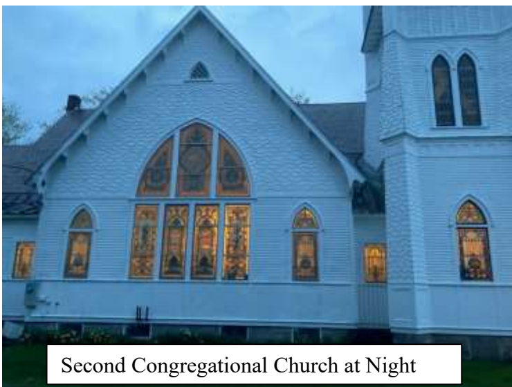
Second Congregational Church at Night

We are ultimately looking for a settled pastor. In working with the Vermont UCC search consultants, it has become evident that there are some very focused things that we need to have in place in order to attract the best candidate possible. We have three main areas that we need to address: