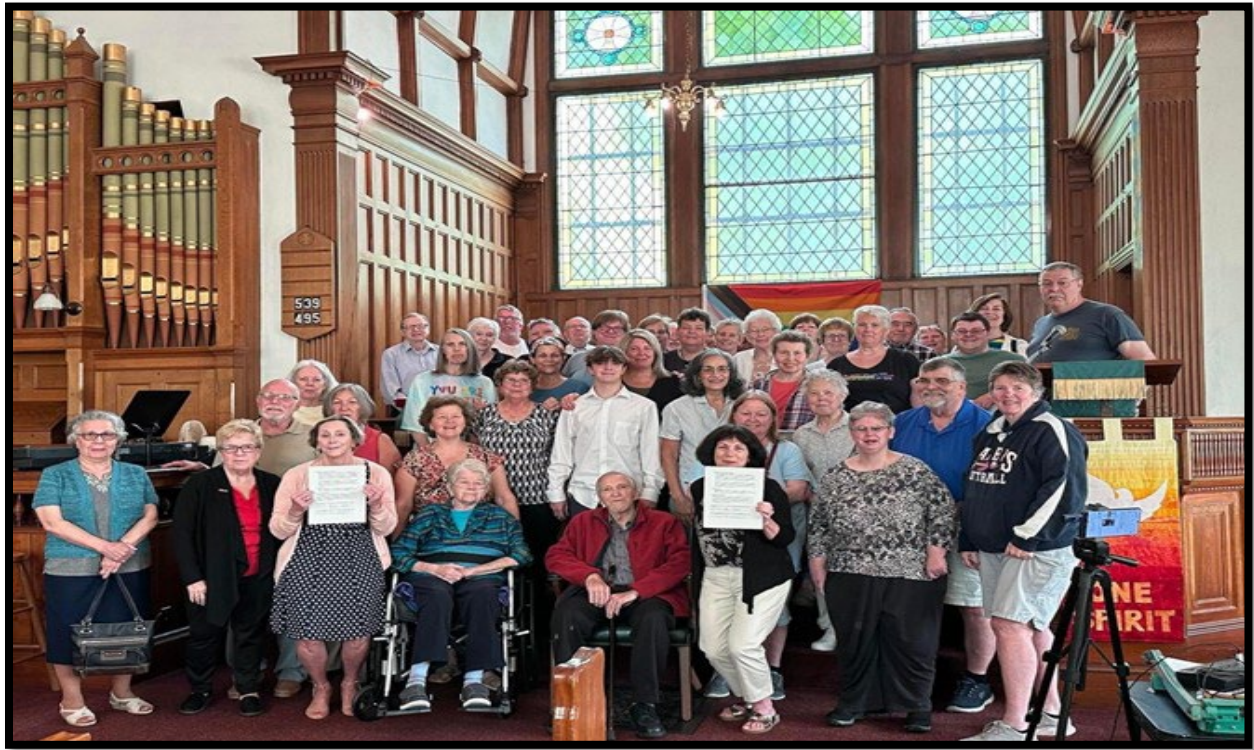
On June 11, 2023, the Covenantal Partnership was signed by both LUCC and NCC

We have learned a great deal from our past experience with conflict. We have learned that direct, timely, honest communication, albeit difficult, results in a better outcome for all.