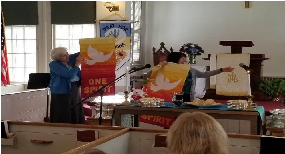
2022 Experimental Partnership