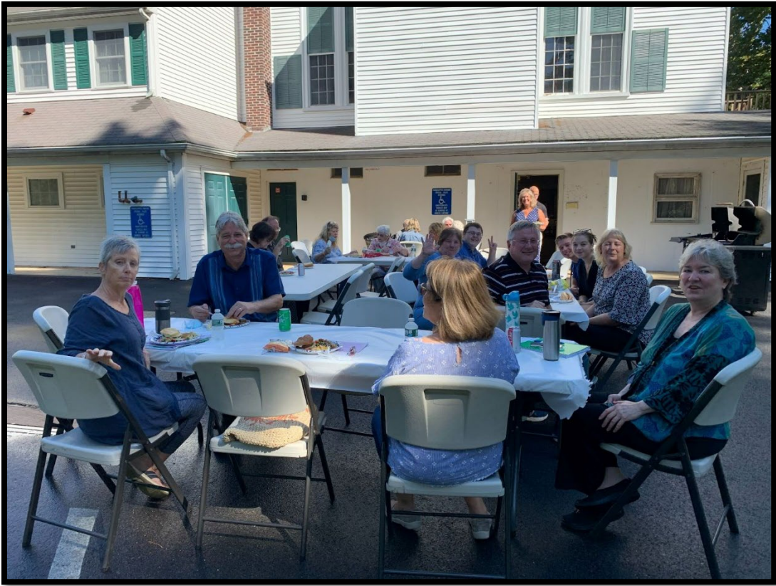
Church Picnic September 2022