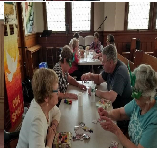
NCC-LUCC Search Teams Cooperative Activity