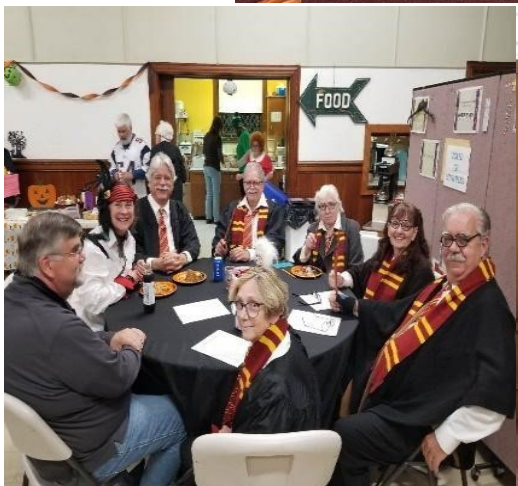
Trivia Night @NCC, LUCC “Winners” 2022