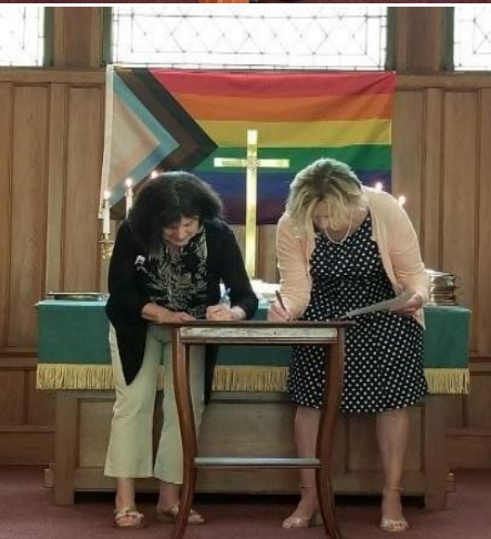
Signing of Covenantal Partnership June 2023