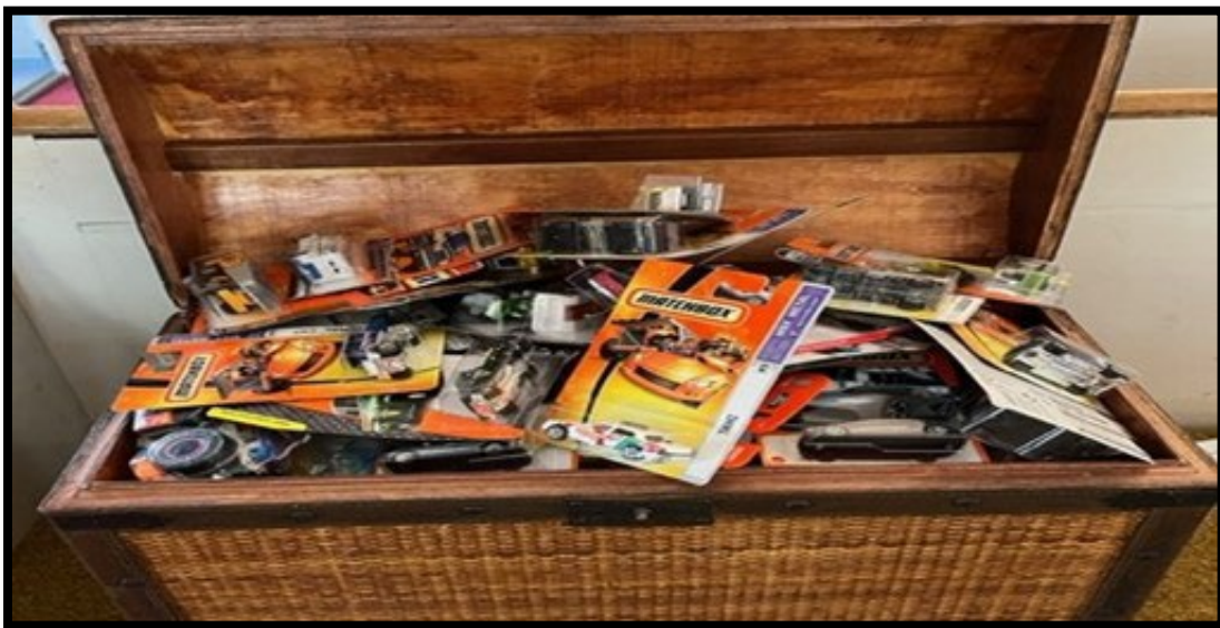
A collection of Matchbox cars was sent to the children of Ukraine via Straight Ahead Ministries.