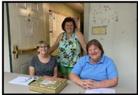
Our curbside Dinner Peeps!