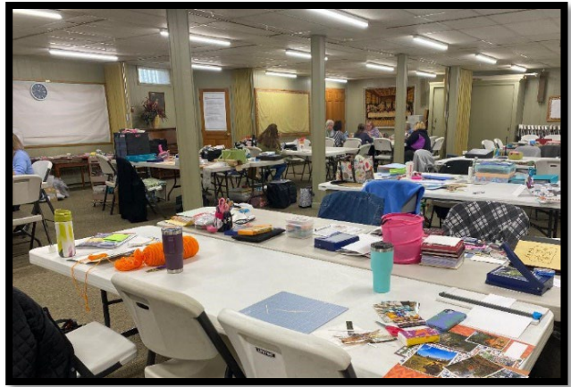
Crop and Craft Day in Fellowship Hall