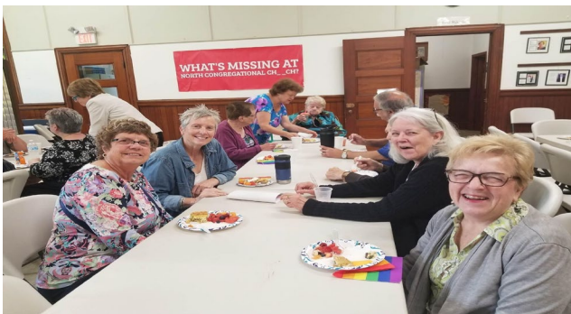
Fellowship After Service