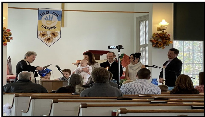
Baptism February 2022