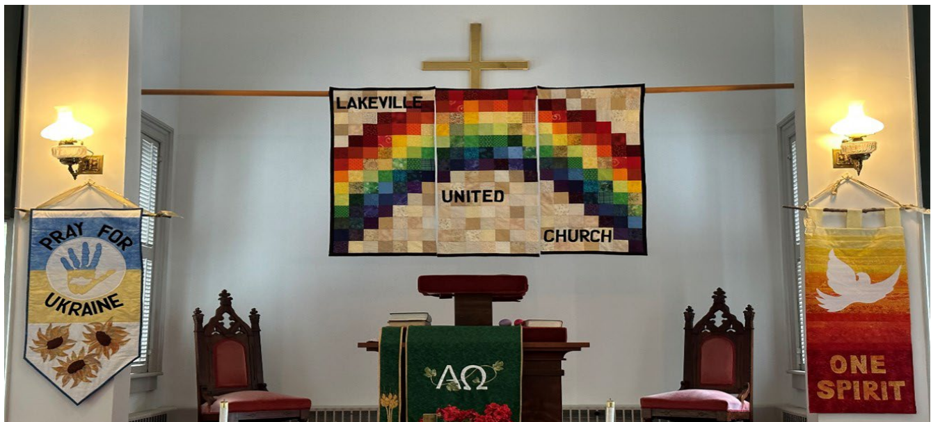
In 2022, our church voted to become an Open and Affirming Church.