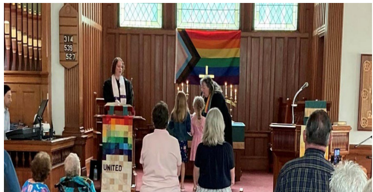
Best Sunday Ushers Ever!