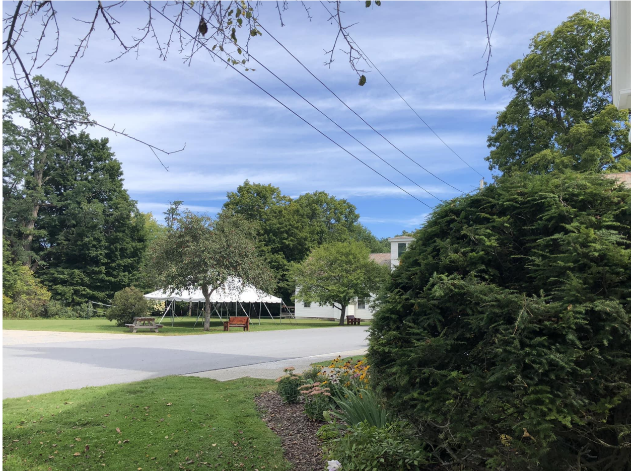
View from the church showing our tented space used for summer worship

The church is an easy ten mile drive to Manchester, an affluent ski and summer resort, and Bennington, an old mill town, home of Bennington College, and the site of the Battle of Bennington, the prelude to the Battle of Saratoga.