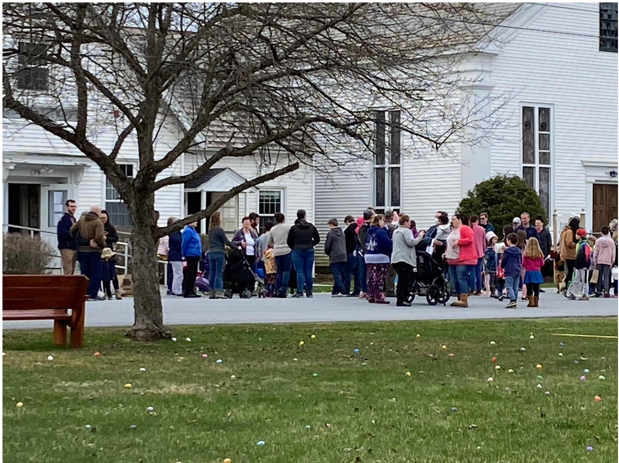
Crowd gathers in anticipation of the annual Easter Egg Hunt.

Arlington, the Federated Church's home, is a mostly rural town with about 2,400 people, a highly rated school system, and an attentive, forward-looking town government. East Arlington, once a manufacturing village, is part of Arlington. Sunderland and Sandgate, bordering Arlington, are small, heavily forested towns, each with fewer than a thousand people.