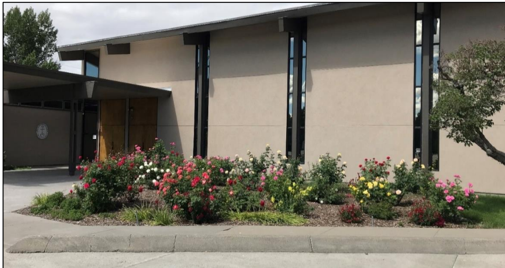
The Rose Garden by our parking lot.