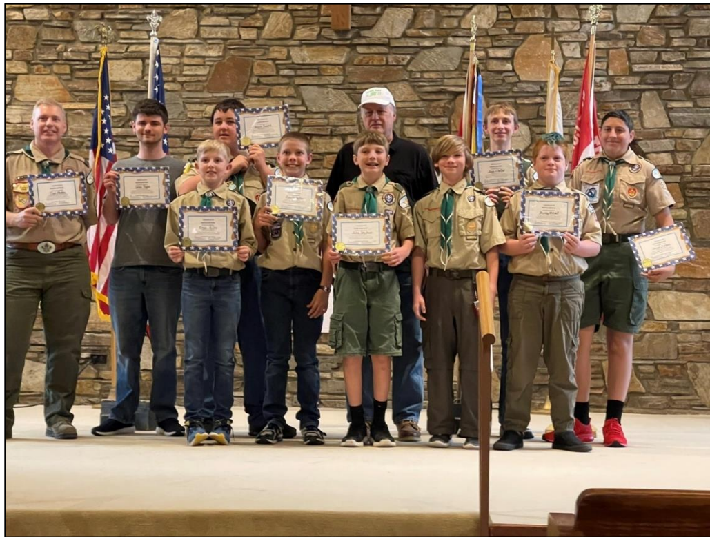
Troop 57, with Certificates of Appreciation.