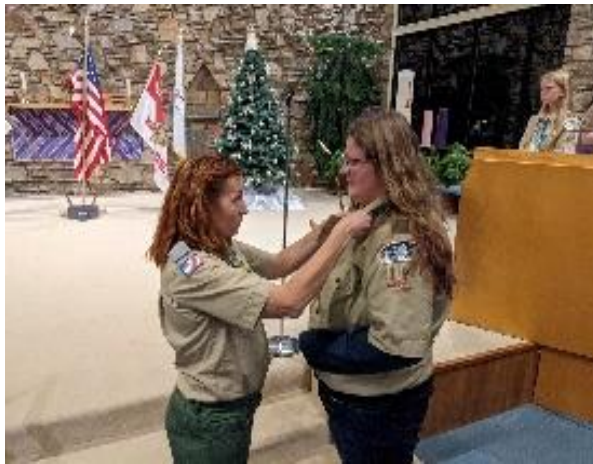
Troop 19 Award Ceremony