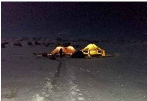
Troop 57 winter camping on Camas Prairie

(Cub Scout Pack 57 grew to nearly 80+ children in 2020 and now meets at the Nazarene Church, which accommodates their numbers better. MHUCC remains the Charter Organization.)