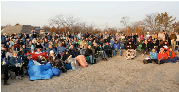
Easter Sunrise Worship Service at Greenwich Point Beach

We know that our church community grows (in numbers and faith) and people attend services most frequently when there are well-presented and thought-provoking sermons. Our congregation values sermons that help us think about the world around us and inspire us to walk in the path of God. We are a forward-thinking congregation, with a high level of spiritual diversity and disparate faith journeys. In the modern world, where all of us are pulled in many directions, the sermon is invaluable in bringing the congregation together. Excellent sermons help people prioritize church over other conflicting commitments.