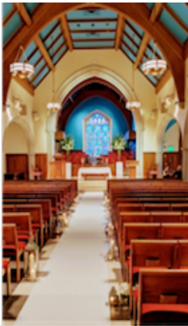
Meetinghouse after 2019 renovation.

The 355-year old First Congregational Church of Greenwich is a physical centerpiece of the Old Greenwich/Riverside community, a beloved church home for a sizable congregation as well as a valued community resource. First Church is a beacon of love and hope, welcoming all who would join us on their faith journey. We are an open and affirming congregation with committed members, vibrant worship, a wonderful music ministry, Christian education for all ages, dynamic youth programs, a long history of mission outreach (including a 54-year old thrift shop operated by our Women's Fellowship that has allocated more than $4,500,000 to local, regional, national and international charities focused on women, children and families, currently averaging over $150,000 per year), and a large preschool and summer day camp. In recent years we have undertaken major renovations to the church and church properties. The Meetinghouse, our main worship space, has been transformed. The sanctuary now has flexible seating, state of the art sound and light systems, magnificent new flooring, and is fully handicap accessible. Finally, we have