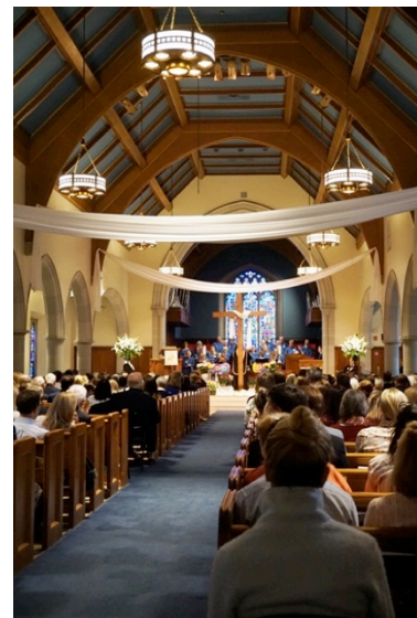
Meetinghouse Sunday Worship Service

We've previously discussed the important role that sermons play in our worship.