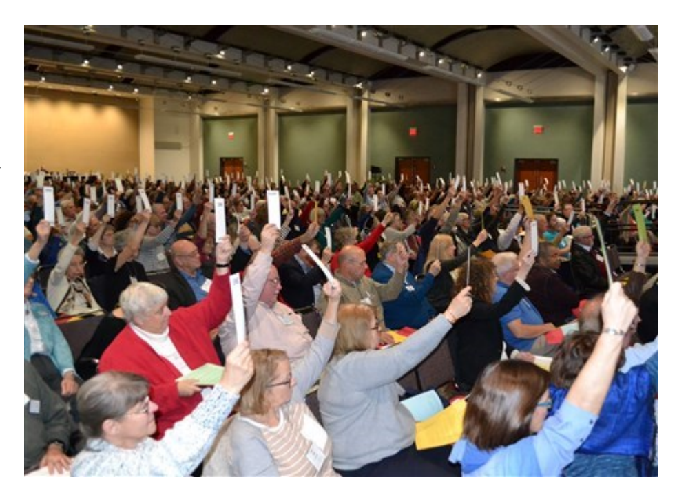
Highlights from the Annual Meeting

Delegates vote on New Name for Conference