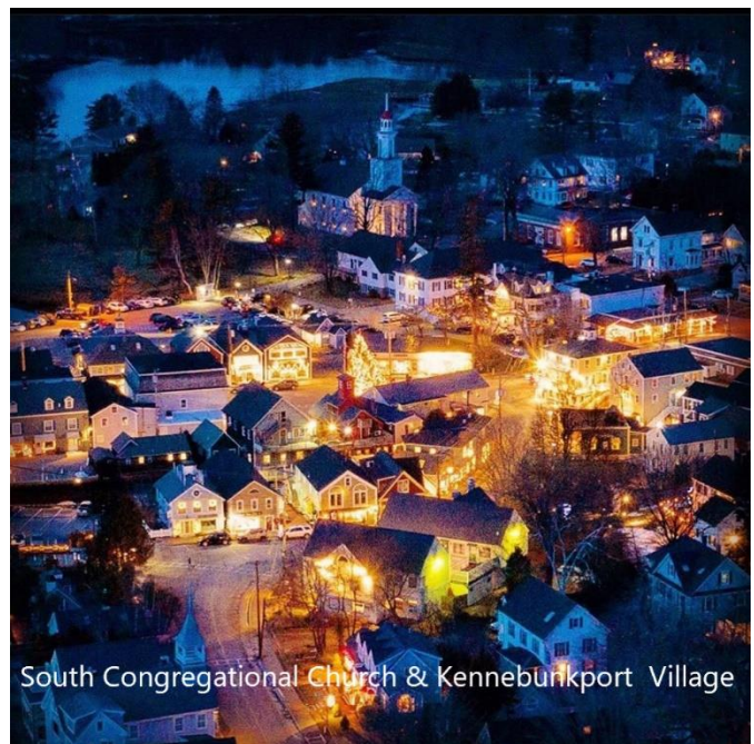
South Congregational Church & Kennebunkport Village

Our towns have very strong communities. The school system is known for academic excellence. There is a K-5 elementary school in Kennebunkport and two elementary schools, a middle school, and high school in Kennebunk. Both towns contain fine examples of early American architecture and offer many opportunities to enjoy music and the arts. Two parks and recreation departments offer programs for toddlers to seniors. There are opportunities for walking on sidewalks, wooded pathways, and