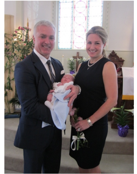
Left to right: Preparing for a laity service, the communion table, recent baptism