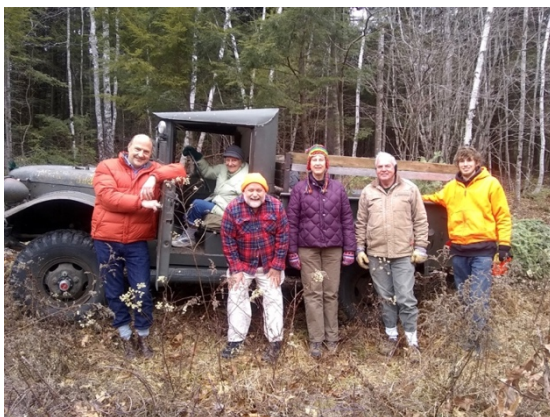
Left to right: Christmas tree expedition, Christmas Eve service

Special services during the year include the popular Christmas Eve candlelight service and the Tenebrae Service on Maundy Thursday. Church traditions include a Christmas tree expedition, Advent luncheon and carol sing, Easter breakfast, and annual fundraising auction. We also participate in the Town of Woolwich’s Memorial Day and Veterans Day services.