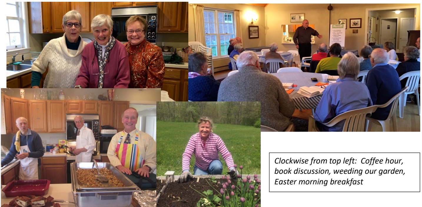
Clockwise from top left: Coffee hour, book discussion, weeding our garden, Easter morning breakfast

With an older congregation, we pay special attention to the access and transportation needs of our members. We have recently modified our facilities to improve access in all weather. The congregation works to ensure that all those needing transportation to services, other church activities, or to medical appointments will have a ride.