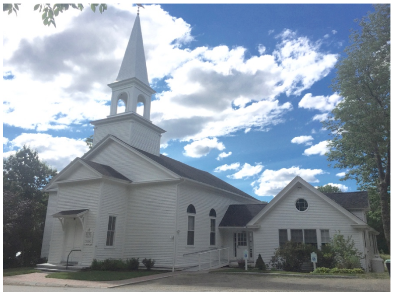
Day's Ferry Congregational Church & Johnson Hall

Like the rest of Maine, the average age of the population in our Midcoast region is projected to increase over the next decade with the "over 65" portion growing to 25%. Our region has a higher level of educational attainment and higher household income than Maine as a whole. Our congregation reflects these demographic trends.