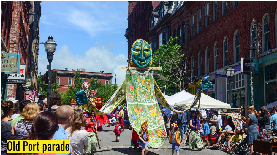
Old Port parade

Welcome to State Street Church. We are a diverse growing congregation, intentional in creating a safe community for all. We are located in the active port city of Portland, Maine.