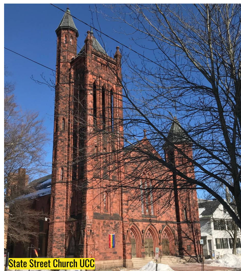
State Street Church UCC