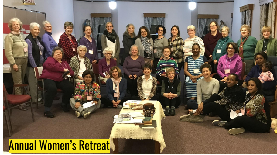
Annual Women's Retreat