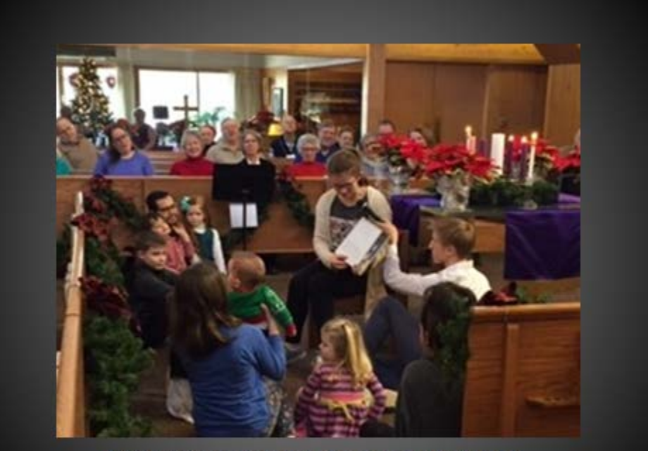
Children's message during Sunday Worship.