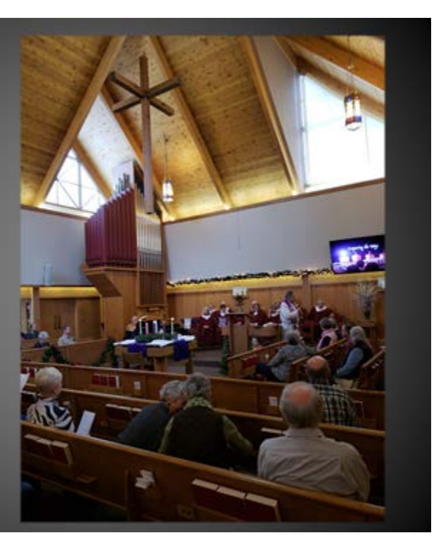
The 3-dimensional cross in our Sanctuary is made of timbers from our original church building.